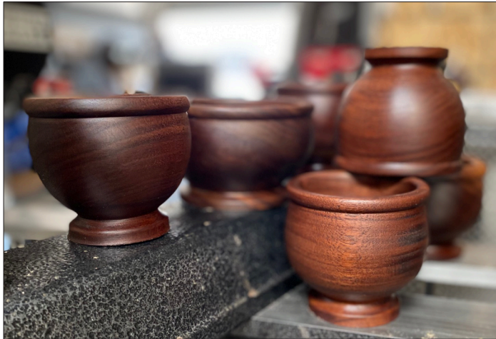
Gonzalo de la Crus