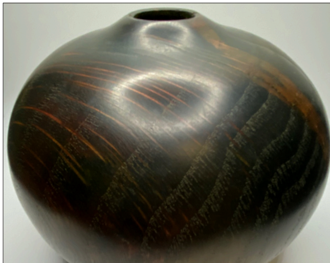
Gonzalo de la Crus