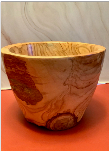
Artisans NC MK