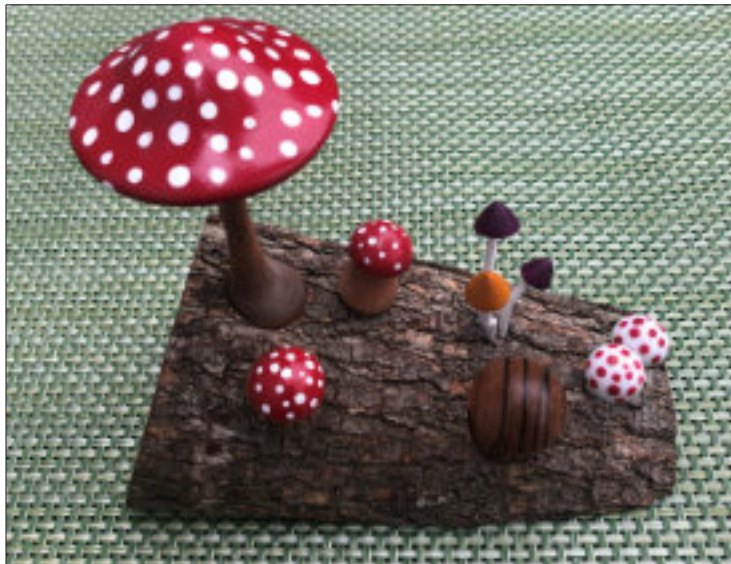
Ron Pollman Mushroom log. Turned mushrooms of multiple woods.