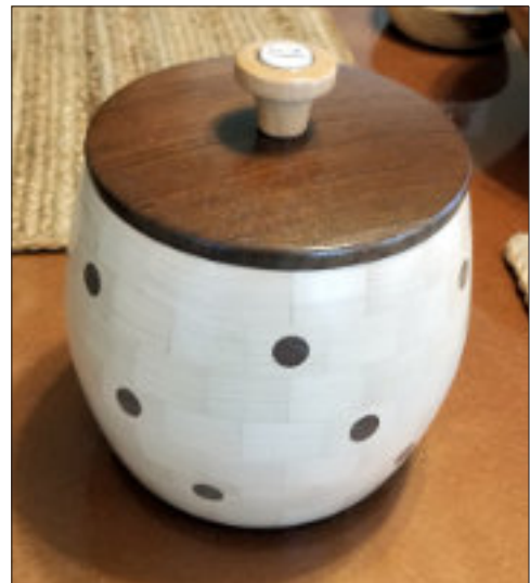
Bob Grinstead Segmented beads of courage box, maple with walnut dots.