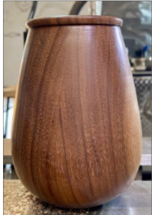
Gonzalo de la Crus Walnut beaded rim vase.