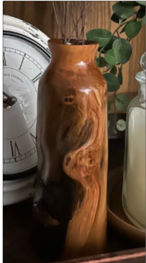
Plum wood vase.

Now, feel free to spread the word about your woodturning club!