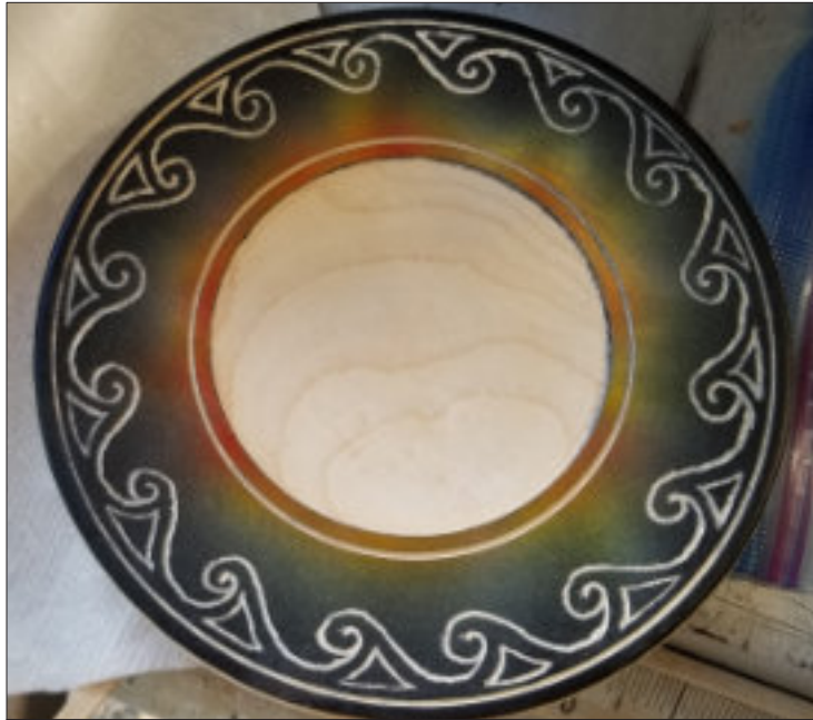
Matt Harber Hard maple, turned, then painted with black gesso. Airbrushed yellow and red from the center. Then the bowl and the concentric rings turned. Using a small template from a french curve, and a diamond sphere bit on the Dremel I carved the "wave" patterns, using the french curve template. Finish is rattle-can spray lacquer.