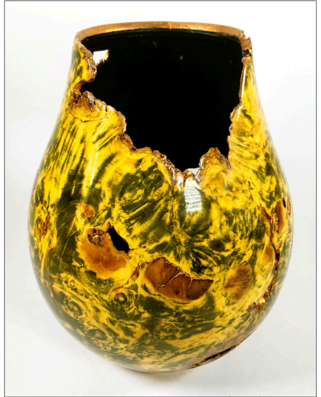
Atelier del Legno