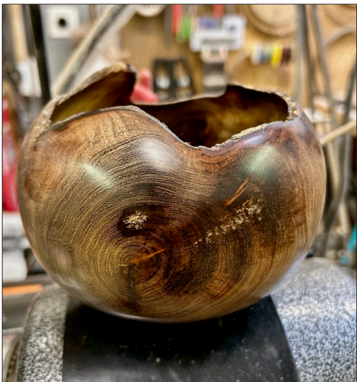
Gonzalo de la Cruz

This page, clockwise from top left: Box elder vase, 4" x 9"; Oak driftwood vessel; Spalted hackberry plate; Mesquite hollowform. Facing page, clockwise from top left: Bradford pear live edge bowl; Sycamore and mahogany multi-axis figurine; Chilean mesquite cocktail muddler, turned multi-axis.