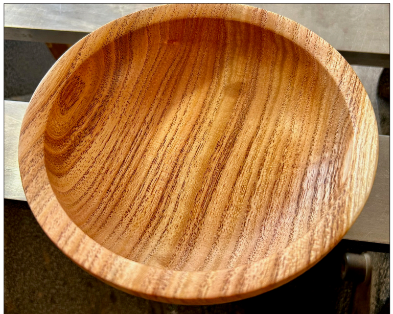
Black pine bowl

Editor's note: Then and Now is an opportunity to share and compare our work from early turnings to our current progress. The intent is to encourage new turners and inspire old hands. If you want, just share images with descriptions, or you can write your own conclusions. E-mail your photos to editor@worldwidewoodturners.org.