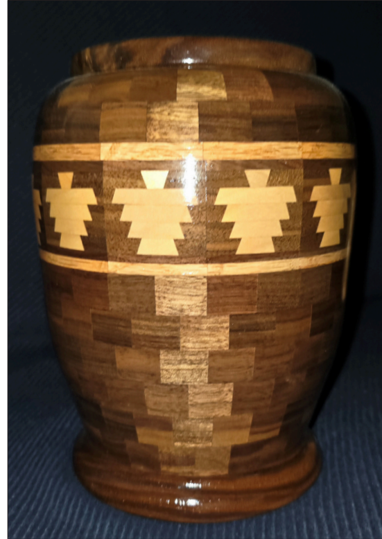
Then and now: By Christian Jensen The light tan container is from 2013 when I first discovered woodturning. The dark Walnut urn is from 2023.